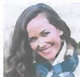
St. Mary of Mount Carmel Youth Director

For registration materials or more information call (609) 652-7729, e-mail: support@camdencharismatic.org Registration forms and on-line ticketing available at http://www.camdencharismatic.org