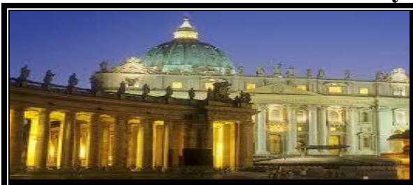
All Are Welcome to Join Us!