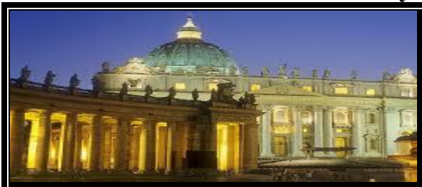
All Are Welcome to Join Us!