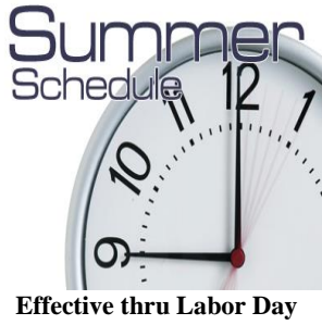
Effective thru Labor Day

Weekend Masses: 4:30pm Saturday, 9am & 10:30am Sunday Communion Service: 9am Monday Daily Mass: 9am Tuesday thru Friday Rectory Office Hours: Monday thru Thursday 9am – 4:30pm