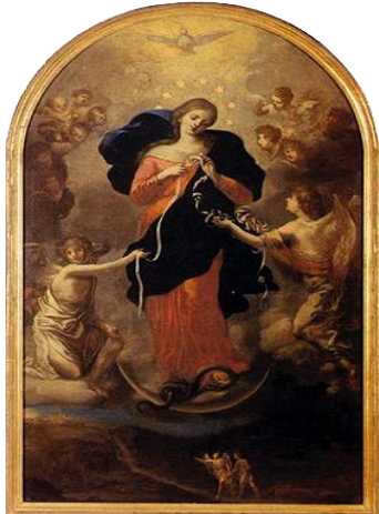
Our Lady, Undoer of Knots