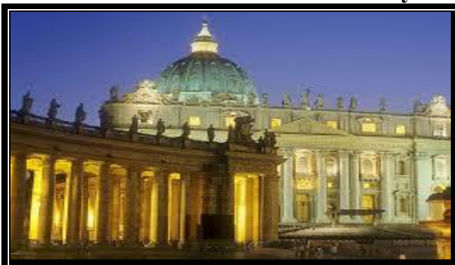
All Are Welcome to Join Us!