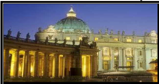
All Are Welcome to Join Us!