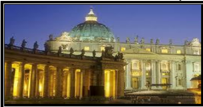
All Are Welcome to Join Us!