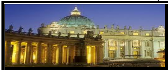
All Are Welcome to Join Us!