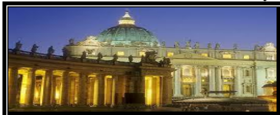
All Are Welcome to Join Us!