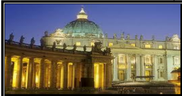
All Are Welcome to Join Us!