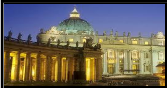
All Are Welcome to Join Us!