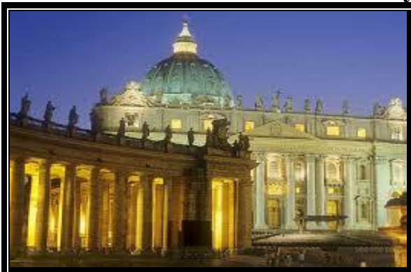
All Are Welcome to Join Us!