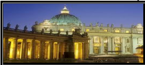
All Are Welcome to Join Us!