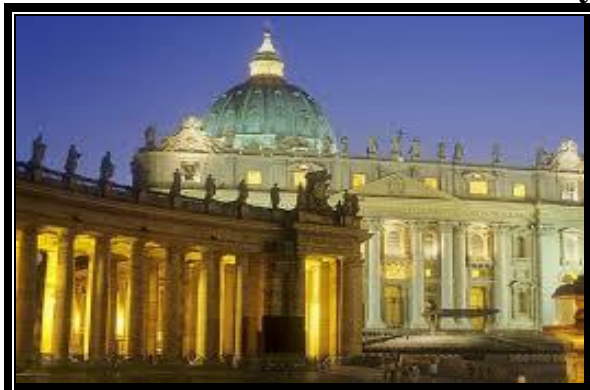
All Are Welcome to Join Us!