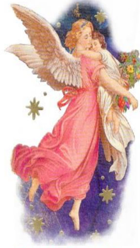
And He Will Raise You Up On Eagle's Wings...