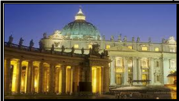
All Are Welcome to Join Us!