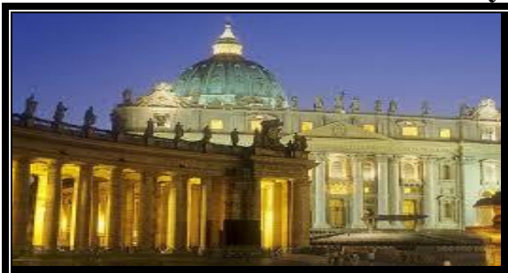
All Are Welcome to Join Us!