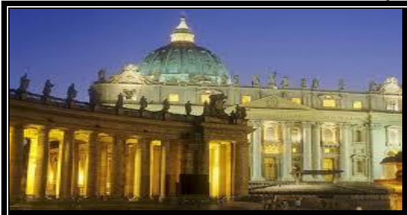
All Are Welcome to Join Us!