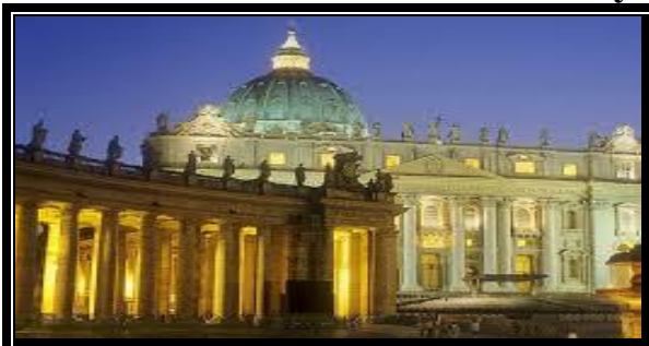
All Are Welcome to Join Us!