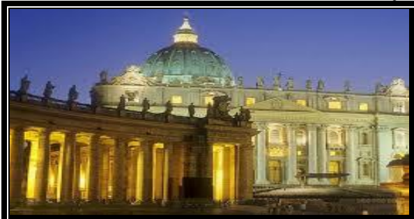
All Are Welcome to Join Us!